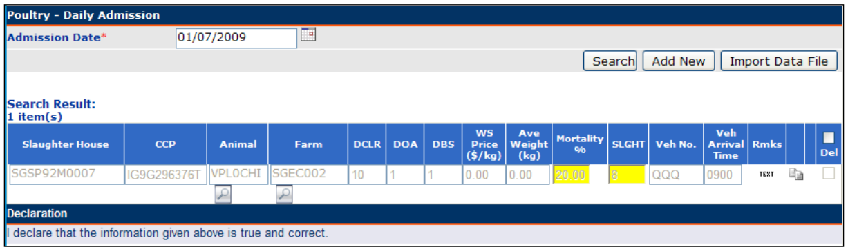
Figure 5: Poultry – Daily Admission (Search)